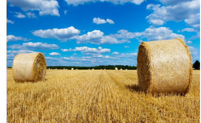
3 rd principle: Use of leftovers/residues